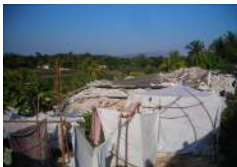
The huge pile of rubble behind the “tents” used to be a church.