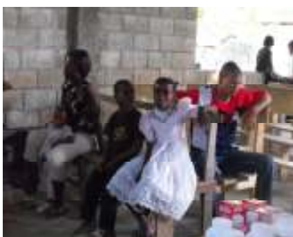
Dressed in her best to see the doctor.