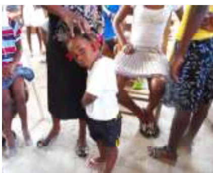
Very shy but very sweet little girl.