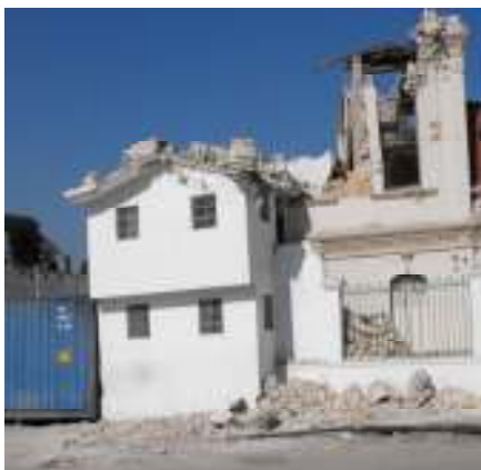
Eighty per cent of the buildings in Leogone are damaged beyond repair.