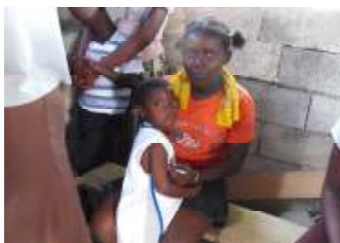
Fear and sadness were everywhere.